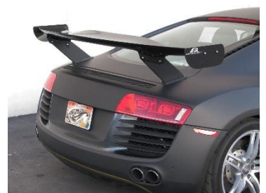
GTC-500 Rear Wing

APR Performance, Inc. 4850 Murrieta St Chino, CA 91710 U.S.A Phone: (909) 590-3796 sales@aprperformance.com