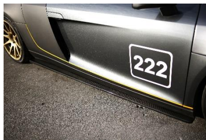
Side Rocker Extensions