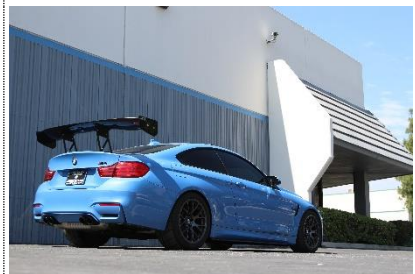
GTC-300 Adjustable Wing

APR Performance, Inc. 4850 Murrieta St Chino, CA 91710 U.S.A Phone: (909) 590-3796 sales@aprperformance.com