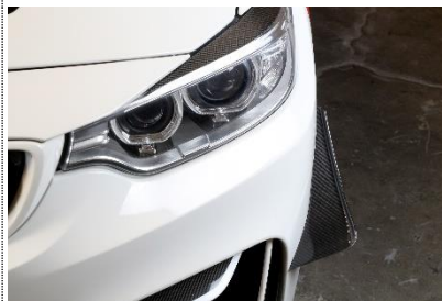
Front Bumper Canards