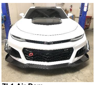
ZL1 Air Dam