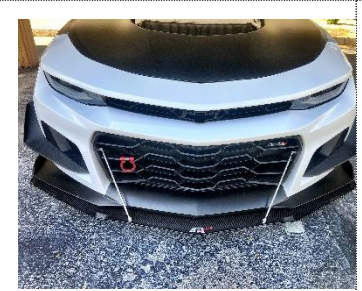
ZL1 Front Splitter