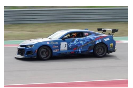
GTC-300 Adjustable Wing