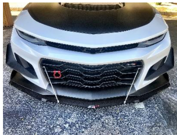
ZL1 Front Splitter