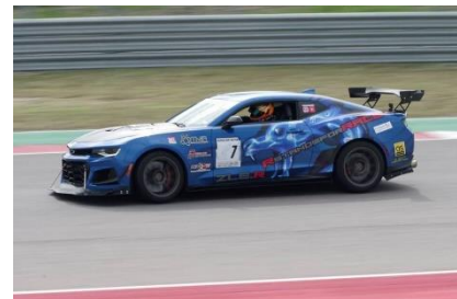
GTC-300 Adjustable Wing

APR Performance, Inc. 4850 Murrieta St Chino, CA 91710 U.S.A Phone: (909) 590-3796 sales@aprperformance.com