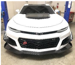
ZL1 Air Dam