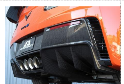
Rear Diffuser Ver. II