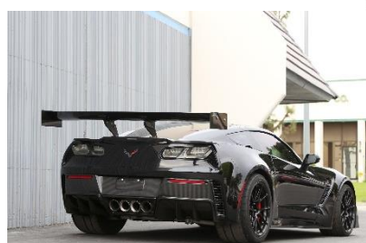
GTC-500 Chassis Mount Adjustable Wing