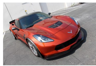
C7 Z06/Grand Sport Front Track Pack Air Dam