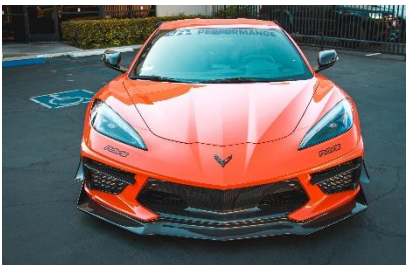
Front Center and Side Bezels