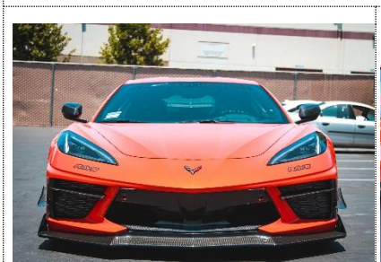
Front Air Dam