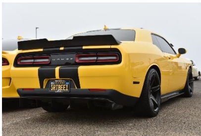
Challenger Rear Deck Spoiler