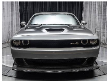
Challenger Hellcat Airdam