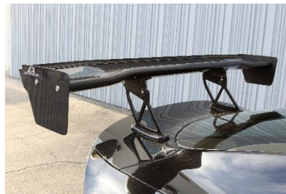
GTC-500 Adjustable Wing

APR Performance, Inc. 4850 Murrieta St Chino, CA 91710 U.S.A Phone: (909) 590-3796 sales@aprperformance.com