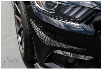
Front Bumper Canards