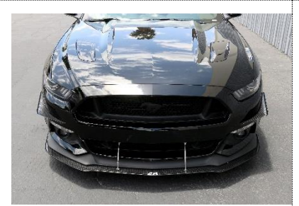
Wind Splitter with Rods