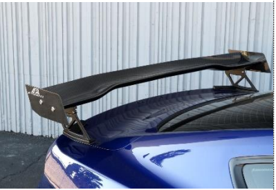
GTC-200 Adjustable Spec Wing