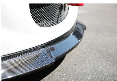
Front Air Dam