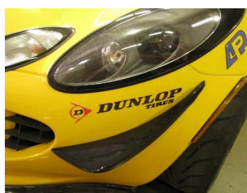
Front Bumper Canards