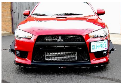
Canards and Front Splitter