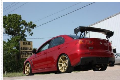
GTC-300 Adjustable Wing

APR Performance, Inc. 4850 Murrieta St Chino, CA 91710 U.S.A Phone: (909) 590-3796 sales@aprperformance.com