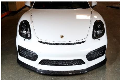
Front Air Dam