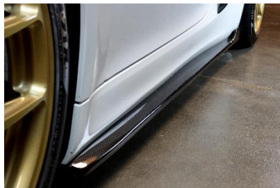
Side Rocker Extensions