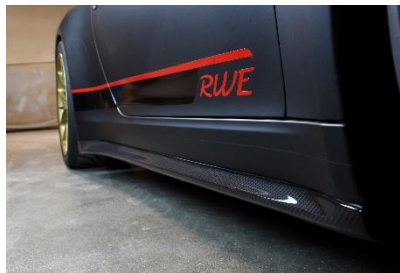
Side Rocker Extensions