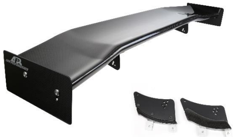
Porsche 991 GT3 Wing Mount Adapters