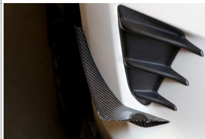
Front Bumper Canards