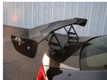
GTC-200 Adjustable Wing

APR Performance, Inc. 4850 Murrieta St Chino, CA 91710 U.S.A Phone: (909) 590-3796 sales@aprperformance.com