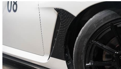
Fender Vent Cover