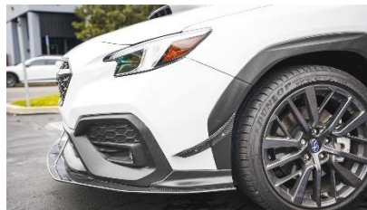
Front Bumper Canards