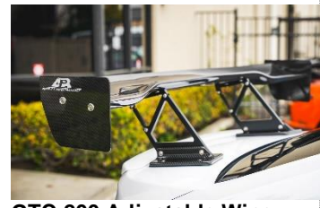
GTC-200 Adjustable Wing

APR Performance, Inc. 4850 Murrieta St Chino, CA 91710 U.S.A Phone: (909) 590-3796 sales@aprperformance.com