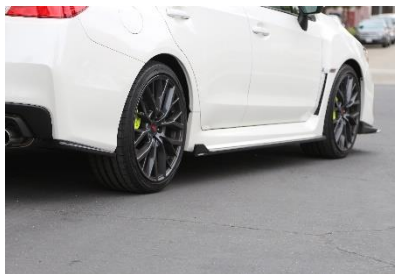
Side Rocker Extension & Rear Bumper Skirts