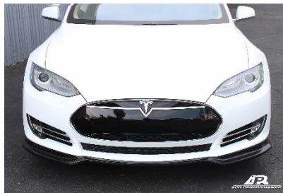
Front Air Dam